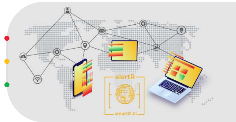
Figure 1: Internet of Things & Internet of Behaviors

The smartR watch by smartR AI complements alertR by offering complete customization of the watch algorithms to meet your specific needs, and providing an interactive experience for the user. Security is built in to the watch from the start.